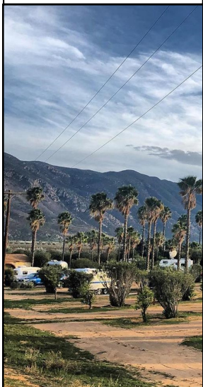
RSM RV PARK

Looking for a place to host your next retreat, conference or camp? Consider coming to RSM in the beautiful Guadalupe Valley, where we have all the amenities to host you and your group. Check out our website for more details or contact us!